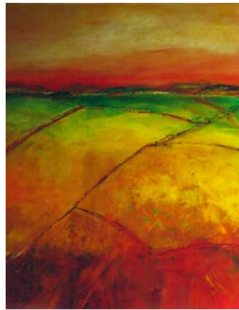
Divided Field 36x30 $2,800