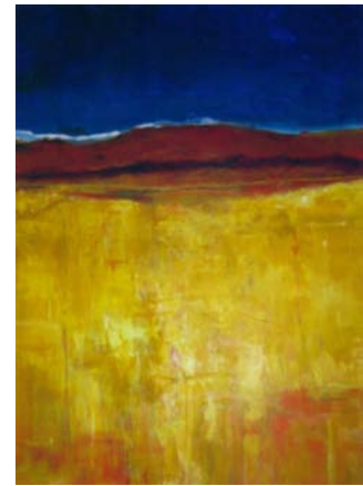
Summer Song 60x48 $8,000