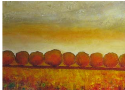
Wind Row 24x30 $2,500