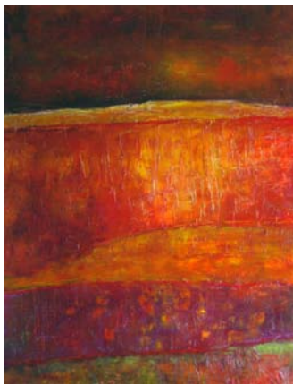
Mid-Night Moon 36x30 $3,000