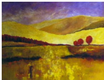
Watching the Land 24x30 $4,000